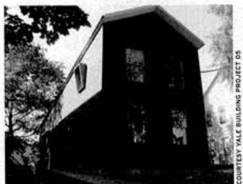
STUDENTS DESIGN NEW HAVEN'S FIRST SOLAR HOUSE