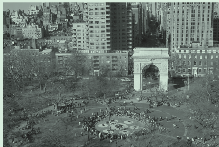
Bird's eye view of Washington Square Park, NYC.

A number of those who champion the idea of the ultimate disappearance of cities envisage vast expanses of the