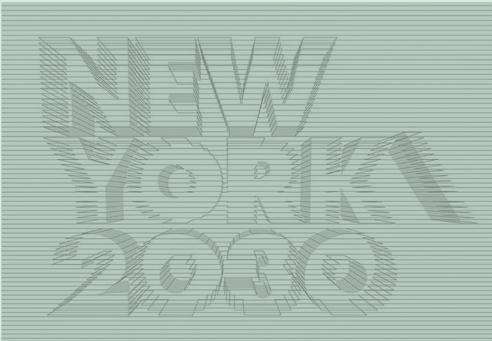
Detail from poster for the NEW YORK/2030 – NEW YORK'S GREEN AND JUST FUTURE SYMPOSIUM.

When common room asked us to host a discussion on institutions we decided to compile a short list of events and texts that, in the past year, have been significant for us. Each text (be it a speech, an article, an essay) opens a window onto the complex world of architecture; together, they offer a picture of the strange workings of architecture as an institution.